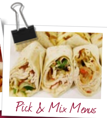
Pick & Mix Menus